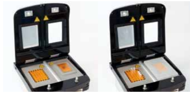
▲ Dual Mix 48 SPR/96 LPR Block

The AlphaSC® combines best of two worlds, the flexibility of a standard cycler with interchangeable blocks for standard PCR plastic and the speed of rapid PCR with all its advantages. Applicable in the AlphaSC® are the Standard-Profile-Rapid (SPR) blocks as well as the Low-Profile-Rapid (LPR) blocks. Thus standard PCR consumables are usable as well as the Low-Profile PCR consumable, which are optimized for low sample consumption. In one word, the AlphaSC® is the most advanced thermal cycler currently available on the market.